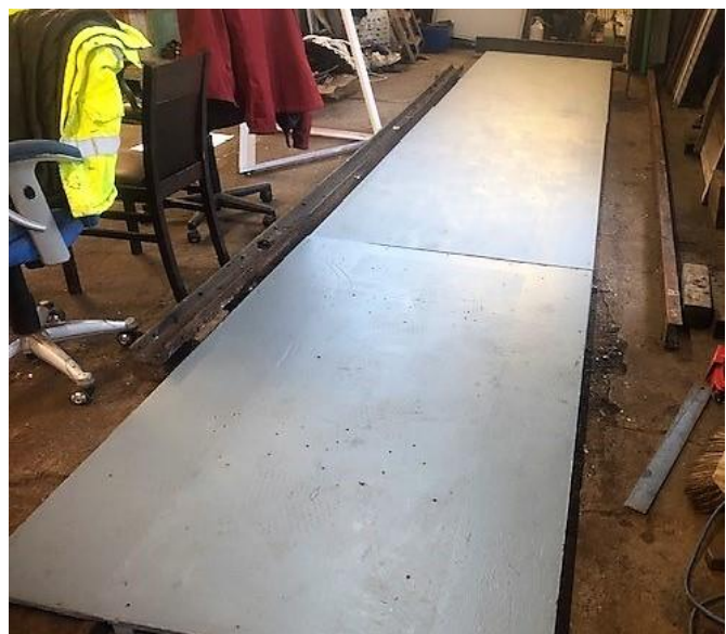
Replacement pit safety boards constructed by the Shed (at the Pier)