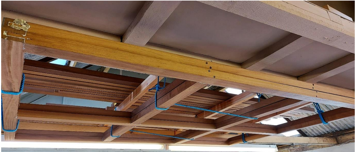
Seaward side carriage framework, awaiting routing, suspended above work surface (Alan Titheridge)