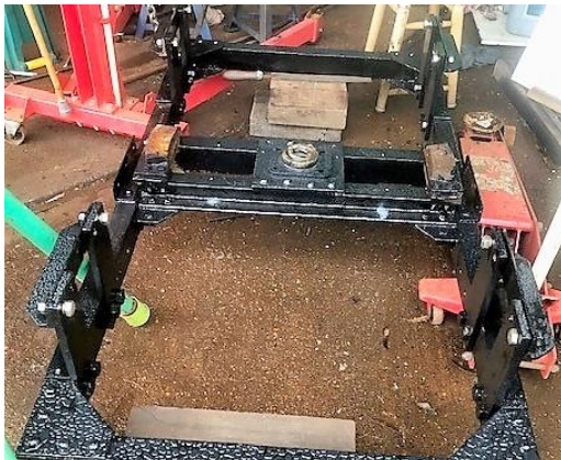
Application of Hammerite complete (Tina Brown)