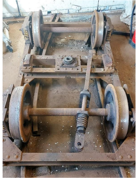
Second bogie stripped awaiting restoration