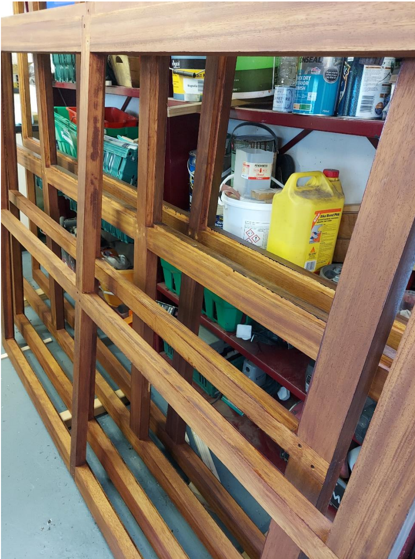
December 15, 2021 – Seaward Side and End timber framework stained, ready for varnishing.