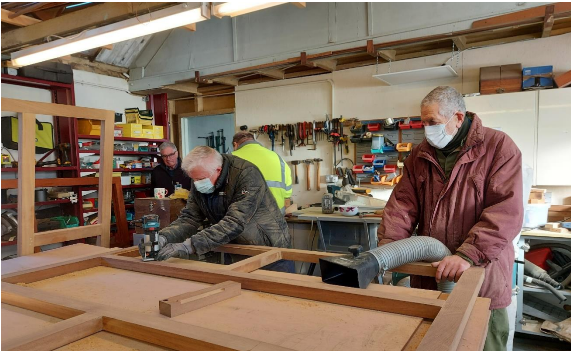
Construction of Door side panels