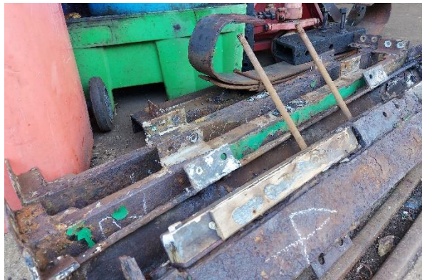
Original frame removed and ready for scrap, showing deterioration