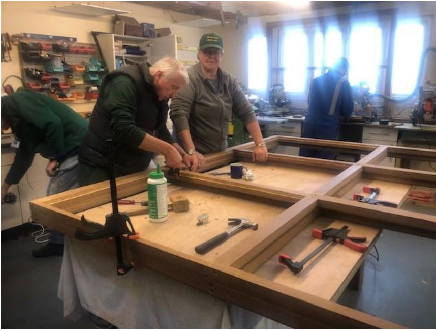
November 30, 2021 – Seaward side timber framework nears completion