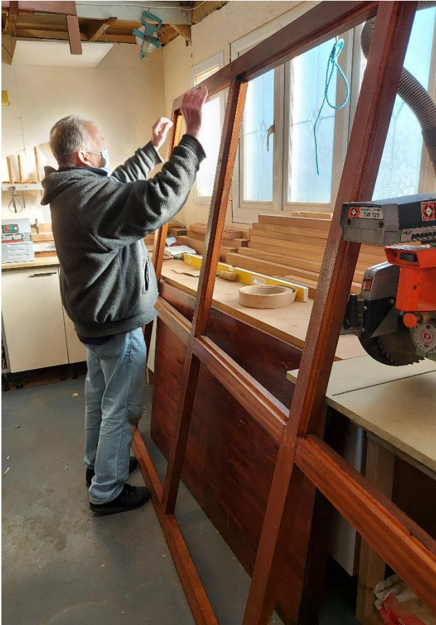
January 5, 2022 – Work on Framework continues