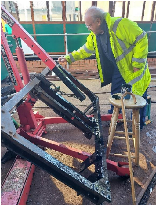
Replacement Frame receiving coat of smooth Hammerite