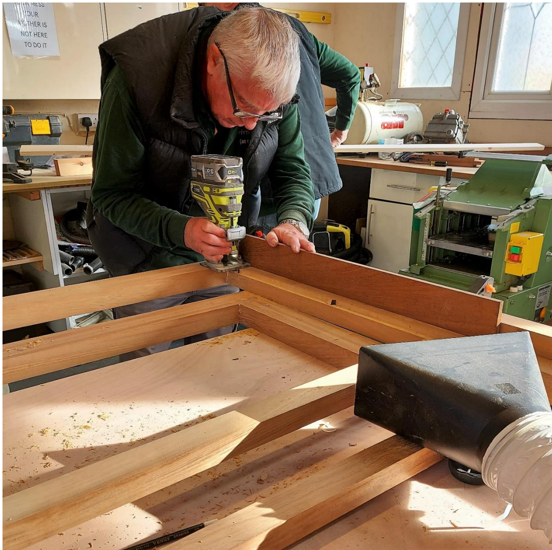
Work continues on Carriage 1 end frame